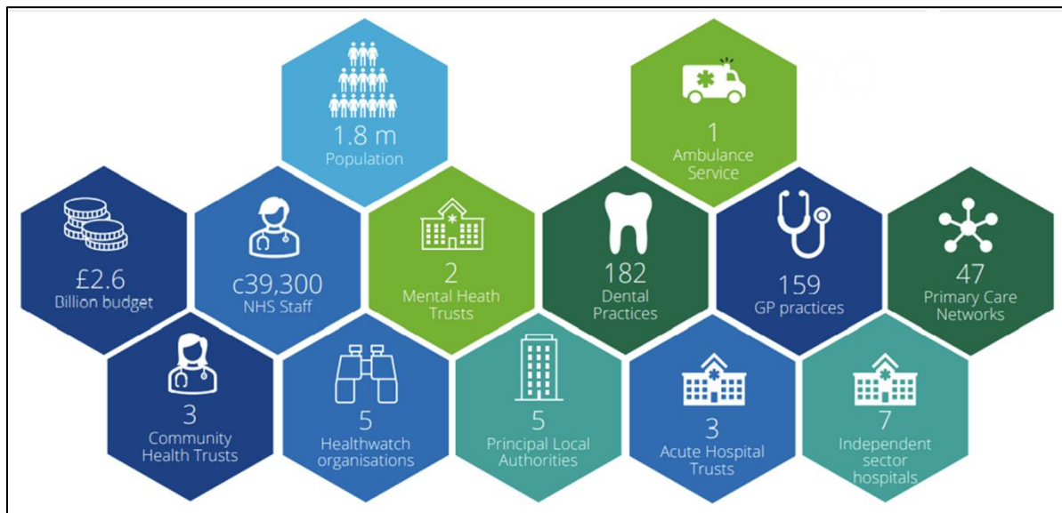
Figure 1: BOB ICS in numbers

Major changes are taking place in the way we organise health and care in Buckinghamshire, Oxfordshire and Berkshire West (BOB) promoting greater cooperation between organisations.